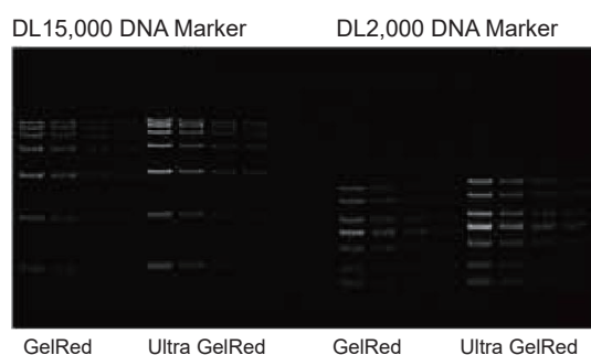
Fig 1. The results of Ultra GelRed and standard GelRed nucleic acid gel staining

Fig 1. and Fig 2. are Ultra GelRed dye nucleic acid electrophoresis and cell membrane permeability assay (cytotoxicity assay), respectively.